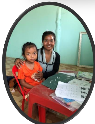
At the weekends, I often study at home with my mom