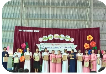
teachers in this year