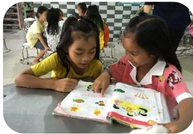
after school at boarding area