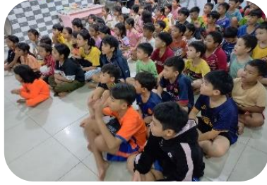
students in boarding area