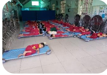
take a snap, (tables for lunch, dinner... )