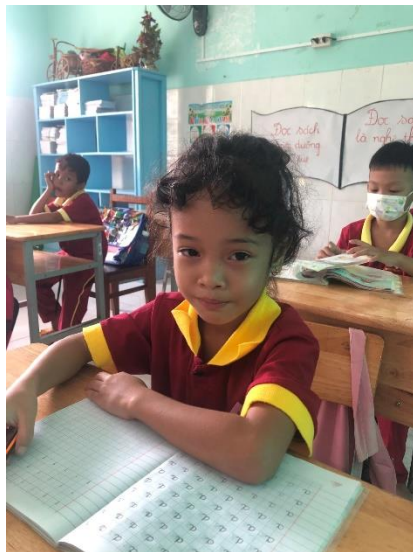
After 3 weeks, I wrote a very cool letter.