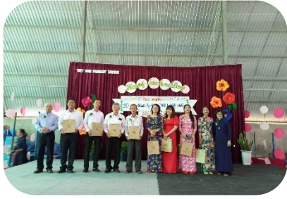
former teacher, staff