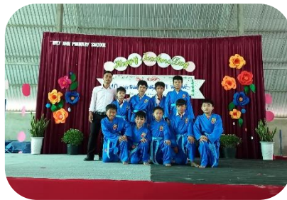
The PE teacher and his vovinam club