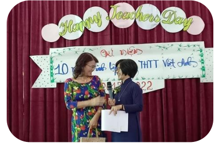
the first principal - the new principal