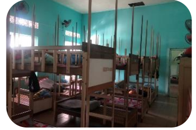
bedroom of boarding area