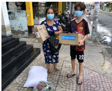
Food and medicine distribution.