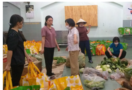
Truckloads of food and medicine were processed, divided and distributed.