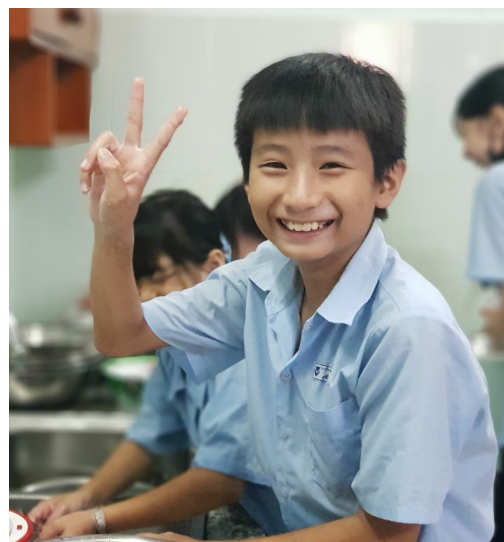
Early 2021 fun at school.

Unfortunately, by spring they saw a surge of illness, all schools went online and the economy stalled. The tough economy resulted in many students returning to small villages as their parent(s) or grandparent(s) lost their