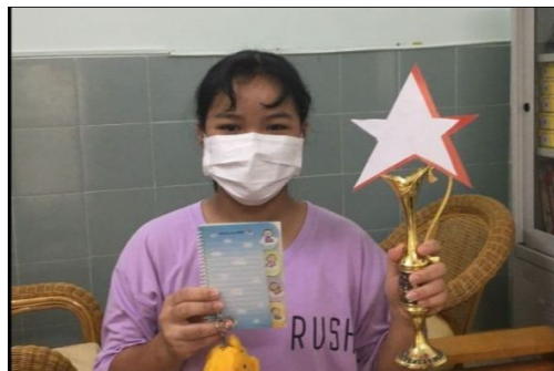
On-line School and prizes to encourage students

The Viet Anh School was fortunate to have the children back in the classroom at the start of the school year, but had to stop in November due to increasing Covid cases in the area. Due to the resource limits of the rural area, it was a struggle.