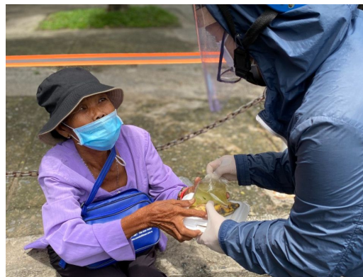
Mid-summer food and medicine distribution at the Anh Linh School.

By the fall of 2021, Anh Linh school reopened the best they could online. Ensuring the children had access to the internet and technology was a challenge that was met by school staff. It was a great challenge to equip the severely impoverished children with the technology needed for online school. They faced the same challenges that others did around the world (e.g. stability of connections, powering devices, building relationships with the students, and motivating them). The teachers rose to the challenge as they shifted to teaching online and created awards and incentives to encourage